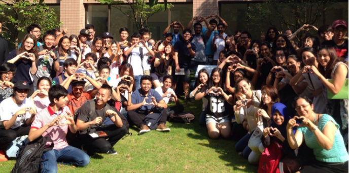
APU students with the hibaku sakura in the middle, July 21 2010 <sup>1</sup>https://science.sciencemag.org/content/341/6151/1235367