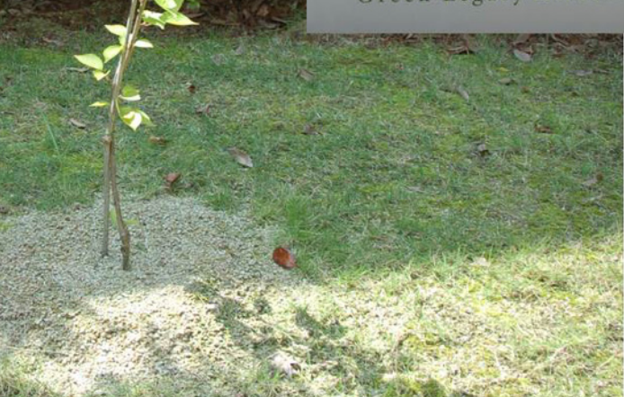
Hibaku Sakura on APU campus before its relocation