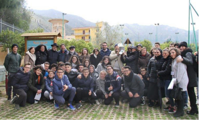
At Centro Padre Nostro, Palermo; March 2018

Besides GLH's current activities, what is something else you think that can be done for the hibaku jumoku for a nuclear-free world and reverence of nature around the world?