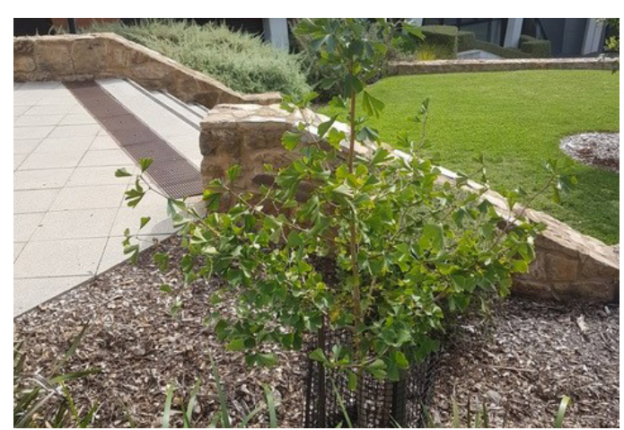
Hibaku Jumoku sapling at ANU in April 2019.

But it is important to keep things in perspective, and to stay optimistic. Pendulums do swing, wheels do turn, lessons are learned, and Presidents and Prime Ministers do change. Optimism is self-reinforcing in the same way that pessimism is self-defeating. Achieving anything of lasting value in public life is difficult enough, but it is almost impossible to do so without believing that what seems to be out of reach really is achievable. The crucial thing is to keep the flame of hope alight, not just in big diplomatic ways, but in a myriad of small ways. With nuclear weapons it is crucial to keep the memory of Hiroshima alive, and to keep alive the idea that out of the ashes of Hiroshima a better and more humane world can indeed grow. That is the mission of GLH, and – like our gingko survivor tree in Canberra – long may it flourish.