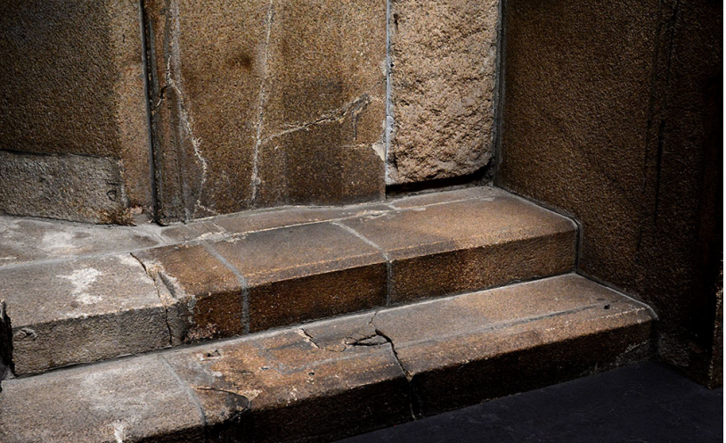
Human Shadow Etched in Stone during the a-bombing. Hiroshima Peace Memorial Museum