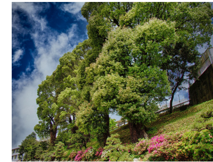
Grove of A-bombed camphors in front of Nagasaki Nishi High School