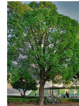
A-bombed camphor in Senda Park, Hiroshima