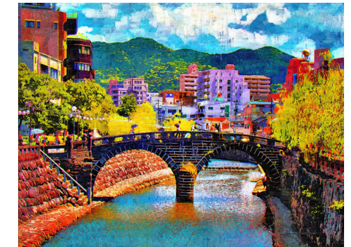
Artistic rendering of downtown Nagasaki, not far from the intended hypocenter