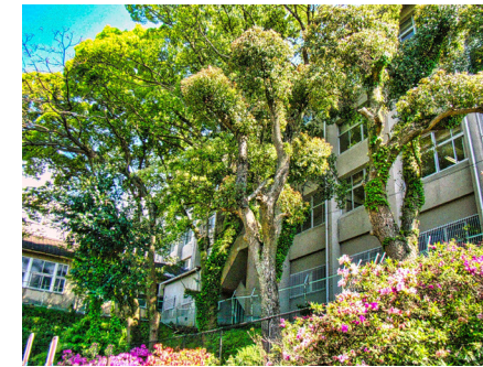
Grove of A-bombed camphors near Chinzei Park, Nagasaki