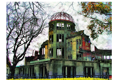
Artistic rendering of the A-bomb Dome at Hiroshima Peace Memorial Park

What do hibaku-jumoku and your connection with Hiroshima mean for you?