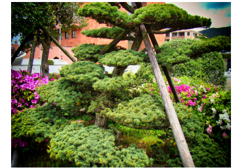
A-bombed white pine, Nagasaki